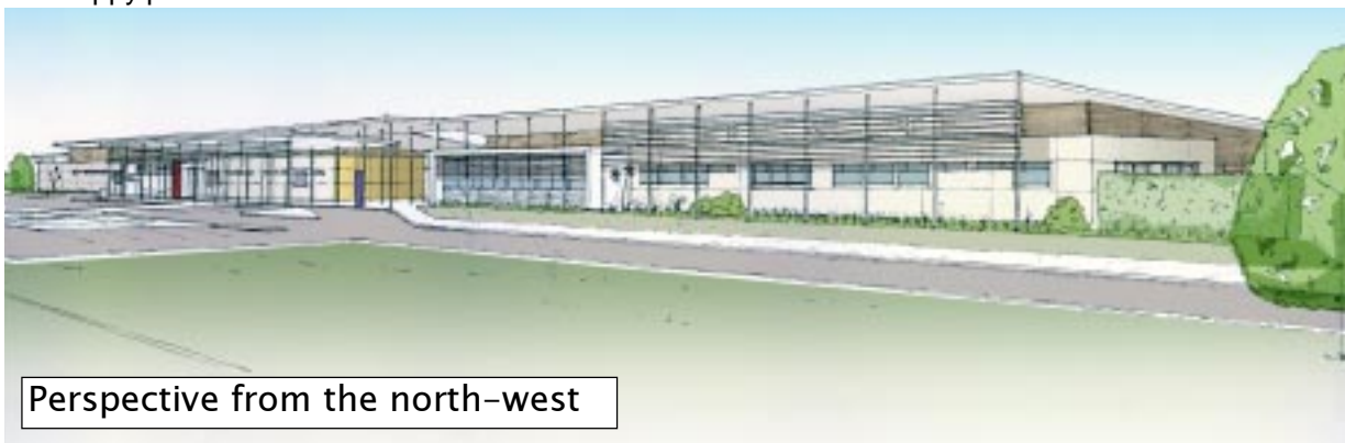
Perspective from the north-west

Below is the architect's sketch of the front of the building looking from Te Ore Ore Road.