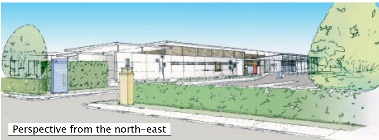
Perspective from the north-east