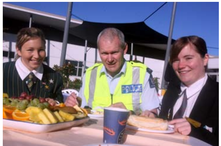
Students enjoy breakfast in the sun with police from 'The Booze Bus'.

SADD students will continue with their work in raising public awareness, especially amongst their peers.