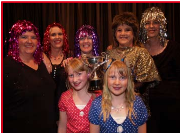
The Winscribe Warblers hoist the winner’s cup. What a performance!

Call or email Jill Stringer on ext. 5840 to order your copy of the Wairarapa Idle, Hospital Revue 2007 DVD, priced $12.