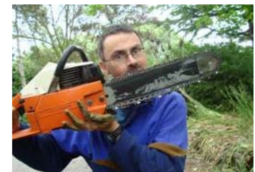
The final cut