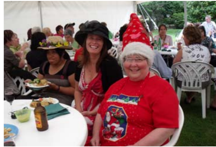
The best hats