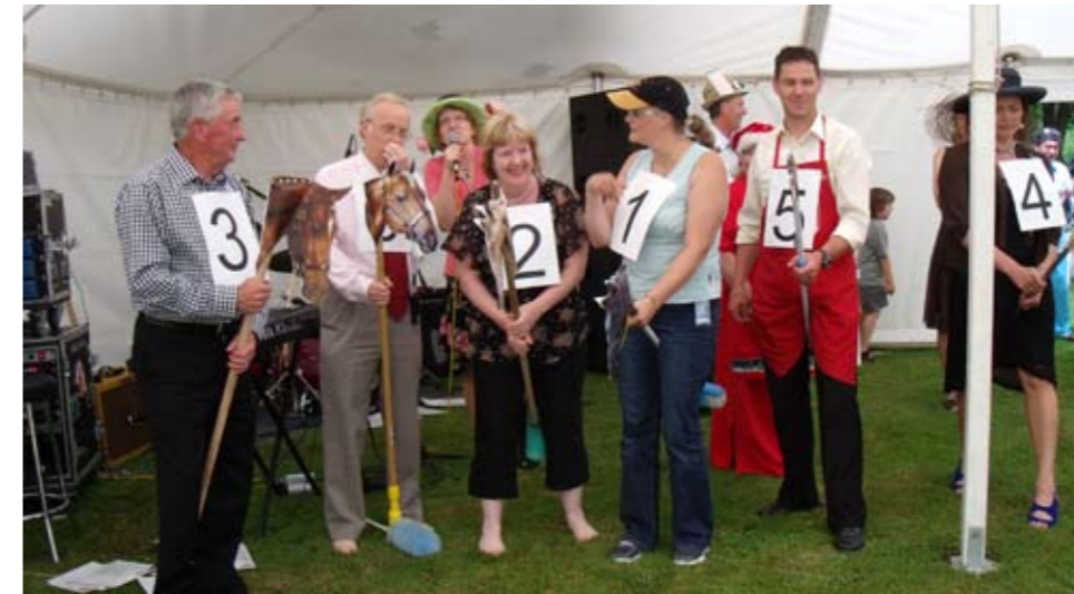
The SLT Cup